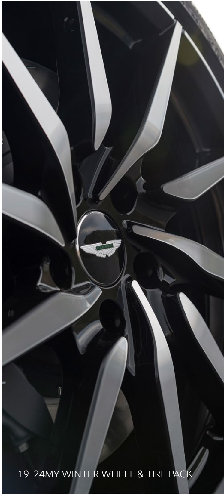
19-24MY WINTER WHEEL & TIRE PACK