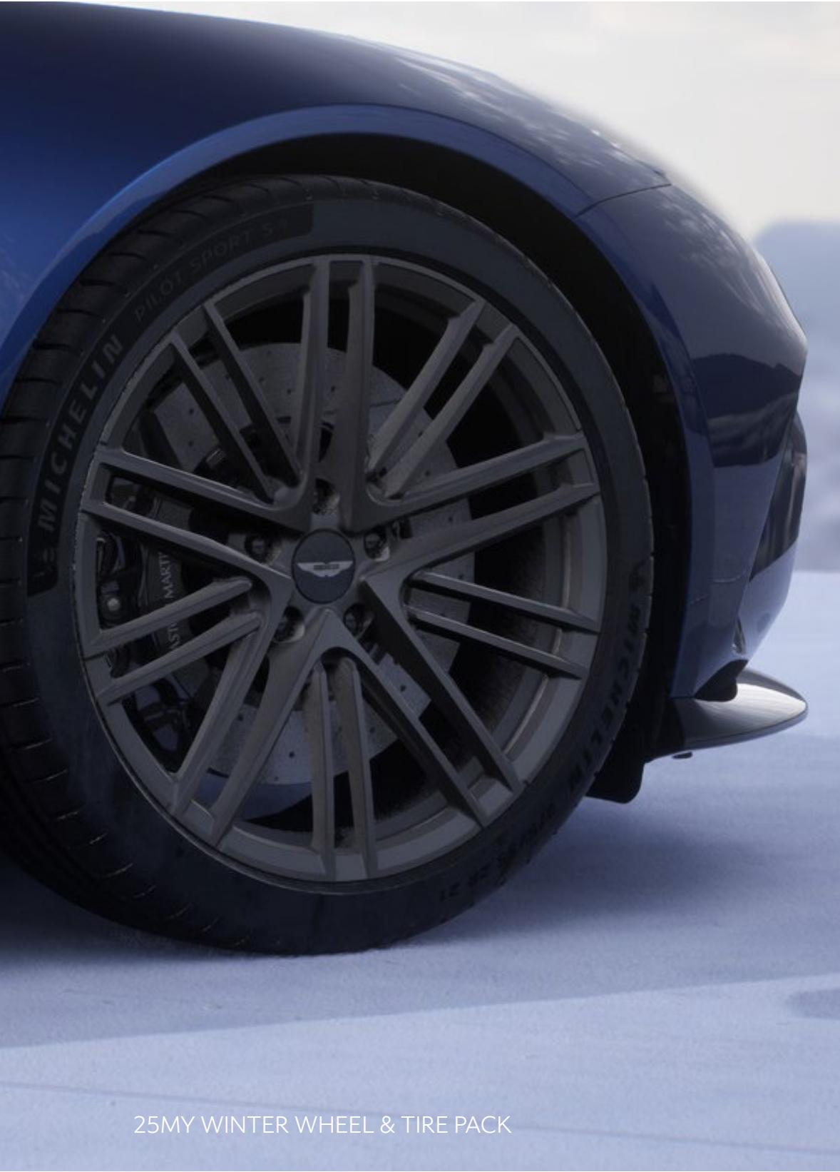
25MY WINTER WHEEL & TIRE PACK